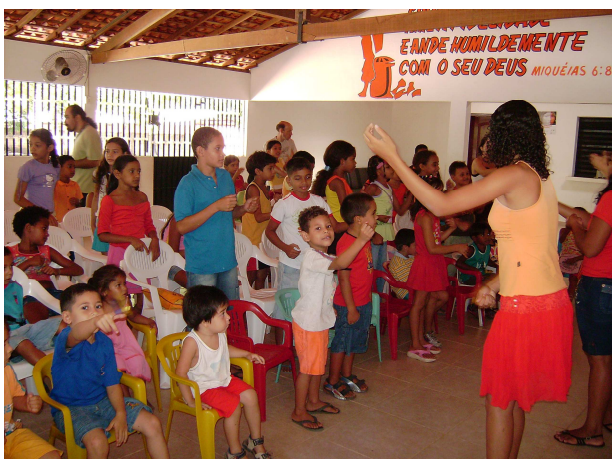
Saturday morning with the kids

dramatize the joy of having Jesus in their lives. We had assumed we would have between 80 and 100 children and catered accordingly. However, this year we had 150 children arrive. To say we were "bursting at the seams" was an understatement. At times it was a little chaotic and very noisy but somehow we managed to feed everyone both with spiritual food and