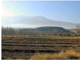
Site of Colosse